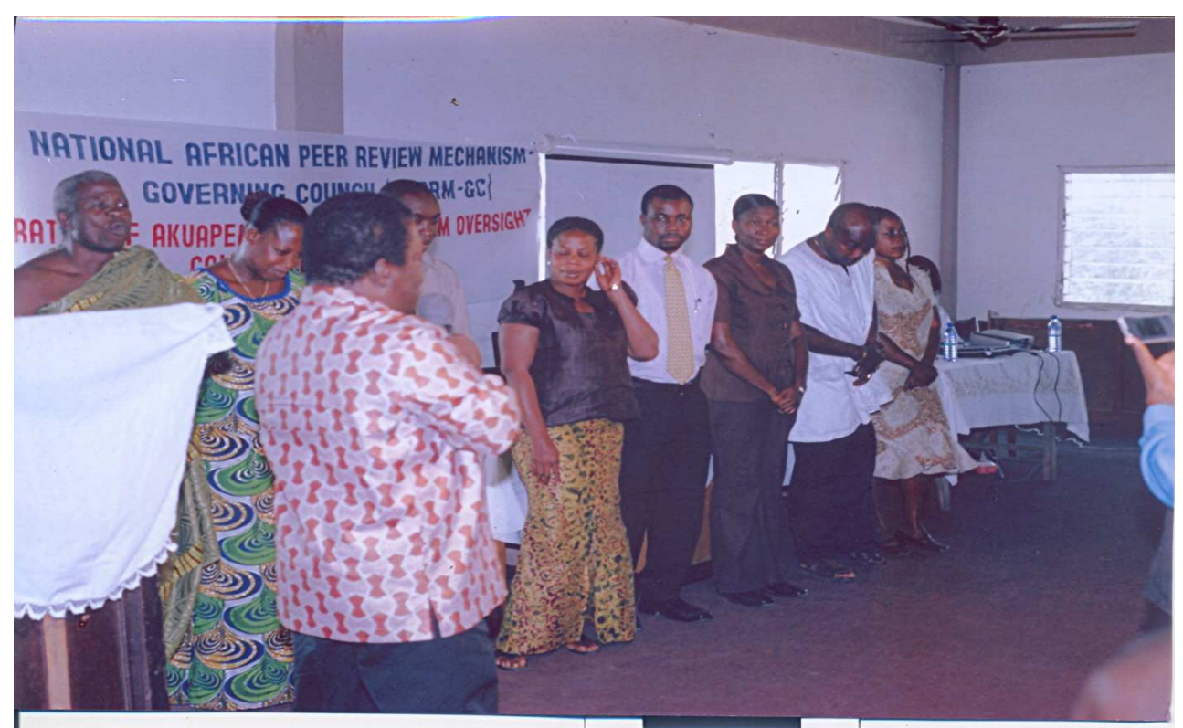
Chairman of NAPRM-GC inaugurating the Akuapem North DOC

Total social security contribution for the first quarter of 2008 increased by 20.8 percent compared to contributions made in the first quarter of 2007. This may be as a result of more firms being established or firms/enterprises that formally were not paying social security for workers signing onto the scheme or existing firms hiring more workers.