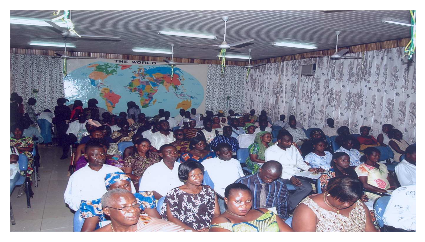
Inauguration Workshop for Sunyani

Total market capitalization of the Ghana insurance industry has increased from GHC115 million to GHC150 million following the passage of the Insurance Act 2006 (Act 724) which seeks to restructure insurance firms and strengthen their solvency and financial soundness.