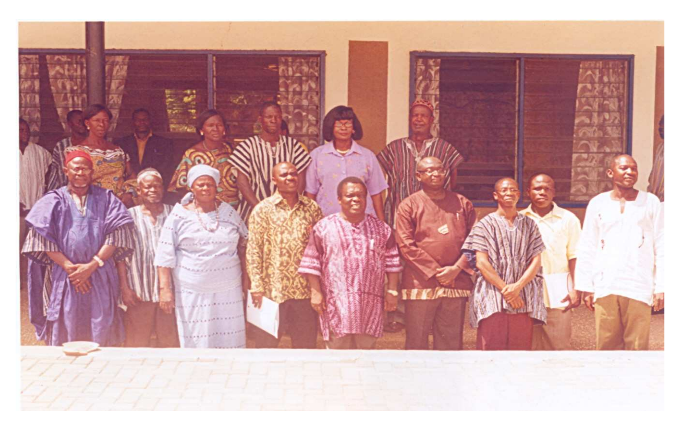
Members of the Wa Municipal Oversight Committees

The NCA has awarded Globacom, a Nigerian mobile operator, a mobile cellular license to operate mobile telecommunication services in Ghana following an international contest. This brings to six the number of companies with licenses to operate mobile services.