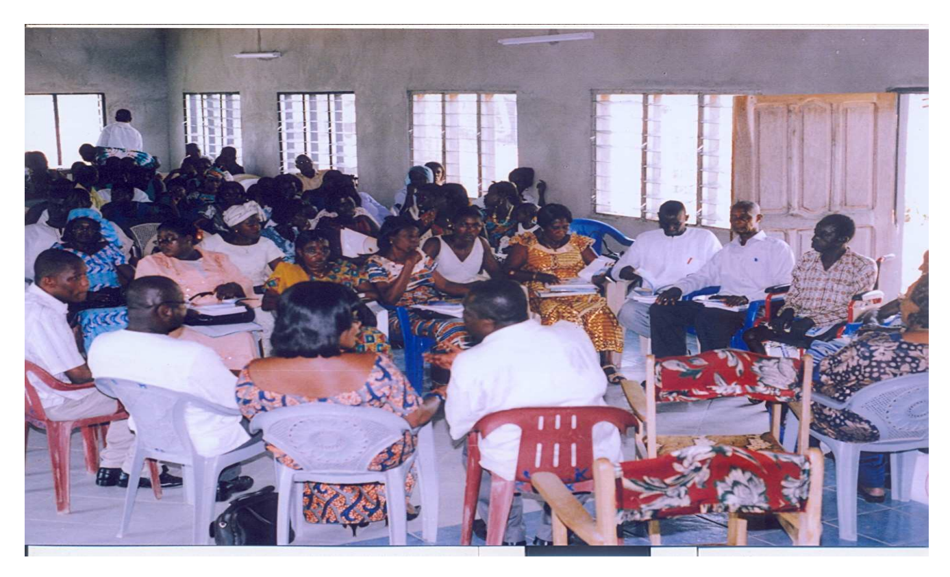
M&E Capacity Building Workshop for Members of District Oversight Committee

will provide mathematics and science modules which have been tailored to suit the new Ghana Education Service curriculum under the education reform.